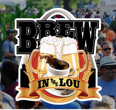
EXHIBIT SPONSOR: $2,500

Includes four VIP Tent tickets, logo/name link on our website, and social media, complimentary vendor tent and verbal recognition at event.